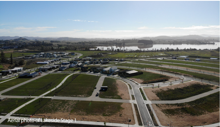
Aerial photo of Lakeside Stage 1