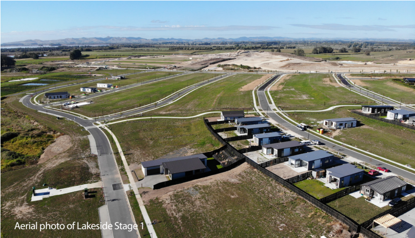
Aerial photo of Lakeside Stage 1